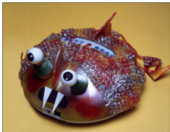
Designing a robot character and giving it a personality has always been a fundamental idea behind Roamer.